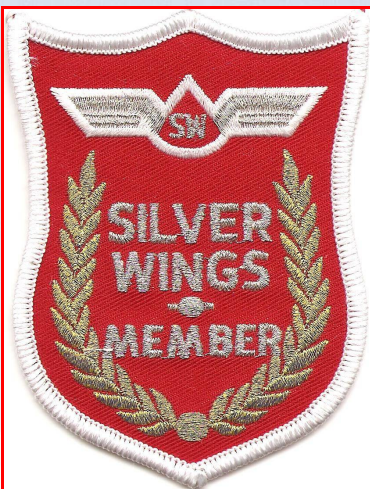
Non-Soloed Associate Member (Red) Cloth Patch/Shield. Perfect for Your Coat Pocket or Flight Suit. $8.00