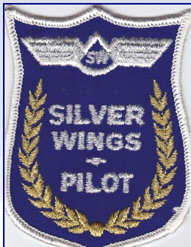
Soloed Active & Associate Member (Blue) Cloth Patch/Shield. Perfect for Your Coat Pocket or Flight Suit. $8.00